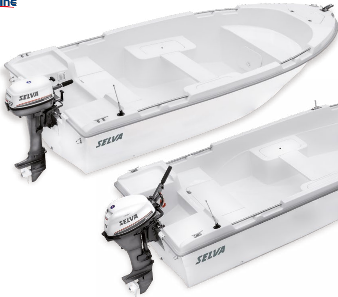
Tiller Line T.4.0